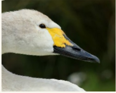
1 Bewick's swan