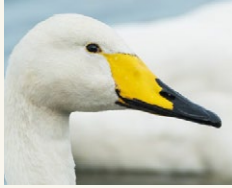
2 Whooper swan

CLUE: The yellow comes further down the beak of a whooper swan than a Bewick's swan.