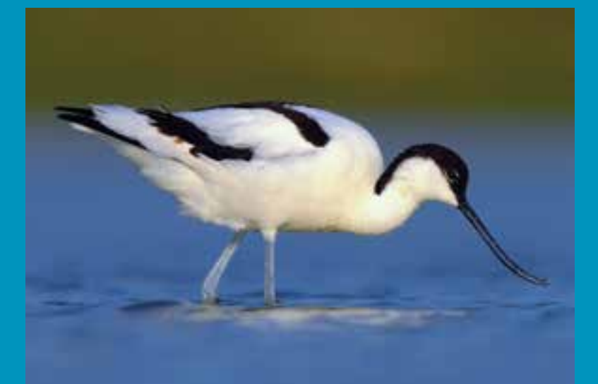
Steart now supports a host of breeding and winter birds.

With the Environment Agency we've created a vast 490 ha wetland in Somerset – one of the largest wetland creation projects in the UK. As well as providing homes for wildlife and a special place for people to enjoy, the wetlands also help mitigate the impacts of climate change by increasing carbon sequestration. In addition, they build climate resilience by helping protect local houses from flooding and by reducing the risks of coastal erosion. WWT Steart Marshes brings together WWT's skills in both wetland creation and management with community engagement, to deliver a new 'working wetland' on a truly remarkable scale.