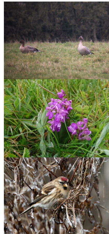
Top: Pink footed goose; Middle: Green winged orchid; Bottom: Lesser redpoll